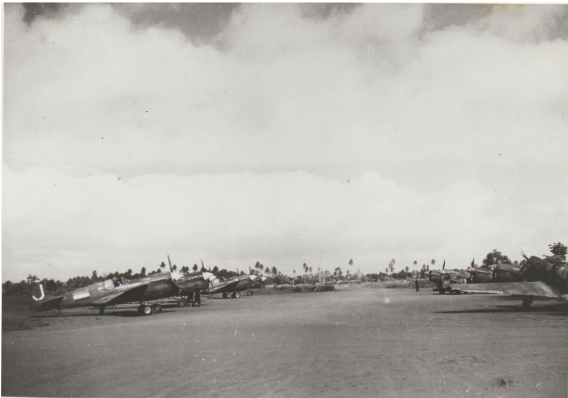
The Stand-by Flight at Mopah in approximately November 1944 (collection B.E. de Smalen).

Tlt Soesman made a dead stick landing at Mopah on 2 October after the engine of his C3-533 caught fire when flying at an altitude of 5,700 metres (19,000 ft). It was one of his very last flights before the end of his tour. Engineering officer Kap Bodemeijer took the engine to the RAAF Depot at Townsville two days later to witness the search for the cause of this. As a result, all P-40s of the squadron were grounded from 6 October up to and including 8 October. After the inquiries the maximum boost and revolutions permitted were considerably lowered. This was followed by a set of new rules from North Eastern Area Headquarters to bring down the number of flying hours made and orders for the CO to arrange mandatory lectures for the pilots to change their handling behaviour of aircraft and engine. 72 The lectures started in the next month (see below). All engines were to be inspected for signs of internal wear and had to be test flown which brought down the number of serviceable