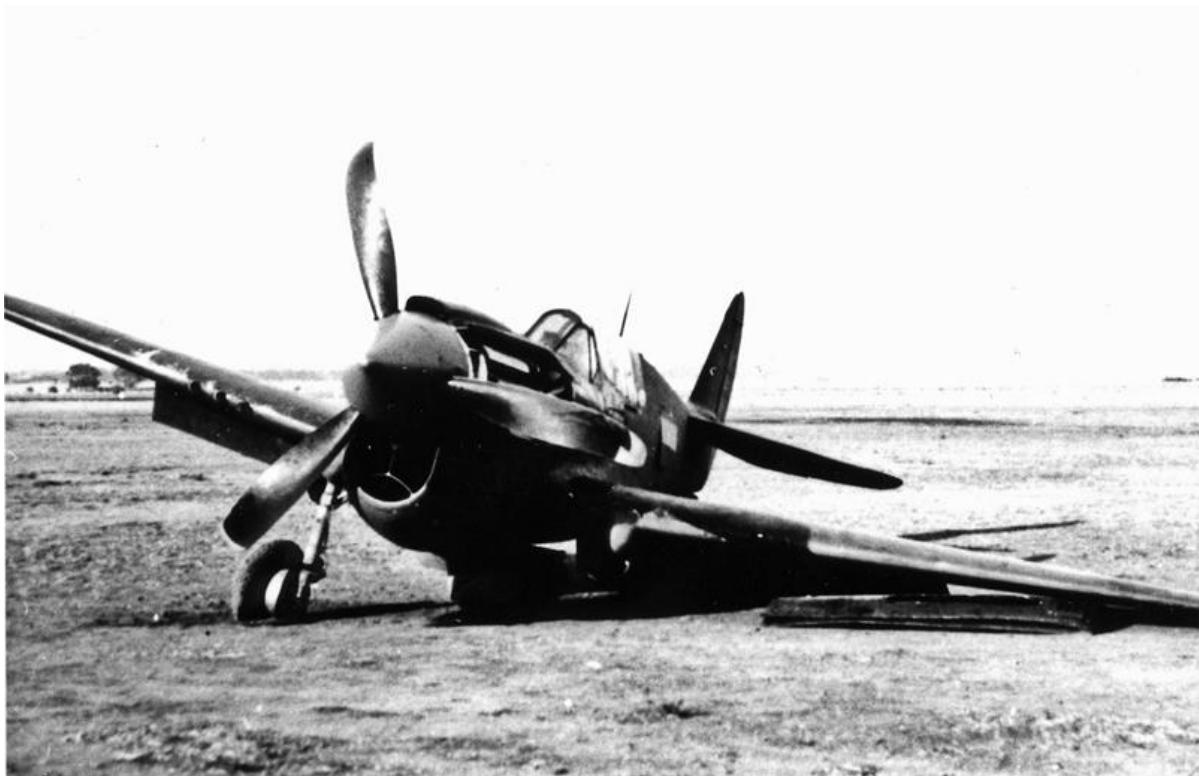
The C3-527 after its crash at Parafield on the return flight to Canberra.

Two TB-25s returned at Canberra from Potshot on 28 March with a total of 16 P-40s. The P-40s flew back via Kalgoorlie, Forrest, Ceduna and Parafield. A 17 th P-40 crashed at Parafield. The C3-523 flown by Sgt T.H. Gottschalk crashed on landing on 27 March due to the bad weather. It had major damage and was repaired at Parafield by 5 Central Recovery Depot RAAF to flyable status and further repaired with the P.E.P. at Canberra. On the next day (29 March) two P-40s and two transport aircraft arrived from Potshot. Two other P-40s (the C3-524 and C3-527) that were flown to Parafield on the 28 th crashed 80 kilometres south of Mildura. Pilots Tlt A.J. Geerts and Sgt J.D. Brameijer lost their way and finally had to bale out due to a lack of fuel after searching in vain for a field to land on. Both were reported safe the next day, although Geerts broke an ankle. A third TB-25 returned at Canberra on 30 March with equipment and personnel. 25