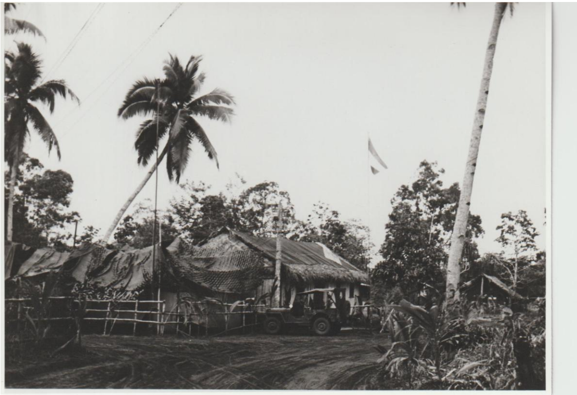
The rather primitive Orderly Room and Squadron Headquarters at Merauke.