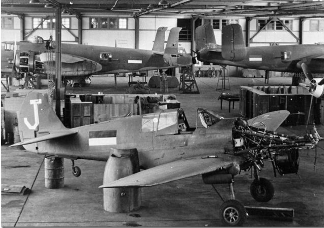
P-40N C3-505 being readied for shipment to Biak and about to receive a new engine in June 1945 at the N.E.I.-P.E.P. at Canberra.

The main party of the ground echelon of 120 (N.E.I.) Squadron arrived in Biak with the Bontekoe on 17 May, while the 28 aircraft arrived at Mokmer strip, Biak on 1 June (11 P-40s), 4 June (two P-40s plus the L12A), 7 June (12 P-40s of which five flown by pilots who returned from Biak with the L12A on 5 June, led by a N.E.I.-P.E.P. TB-25) and 8 June 1945 (three P-40s). The ferry flights had been postponed for a number of days until transport aircraft became available for the movement of the rear echelon. A transport aircraft flew over 25 staff and ground personnel on 7 June, the remaining personnel and equipment being transported by the TB-25. Five of the pilots ferried two aircraft as a number of their colleagues were still in Australia. The final group of 14 pilots departed on 16 May to Canberra for a one week refresher course and 14 pilots returned on 27 May. Of the previous group of pilots sent to Canberra Elt B.J. de Vries had been assigned as 2 nd pilot on a North American B-25 ferry flight, however. He was killed on 2 June when the B-25 crashed on a test flight near Sacramento in the U.S.A. De Vries arrived on 27 March at Merauke for another tour but had been sent back to the P.E.P. in April with approximately five other pilots. Elt Schillmöller, on 19 May, was entered in a six weeks bombing and gunnery instructor course at the Central Gunnery School at Cressy (Vic.). 107 Although the pilots had to