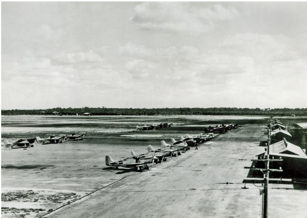
The Fighter Pool of the P.E.P. at Bundaberg showing 14 P-51s and five P-40s photographed approximately early September 1945