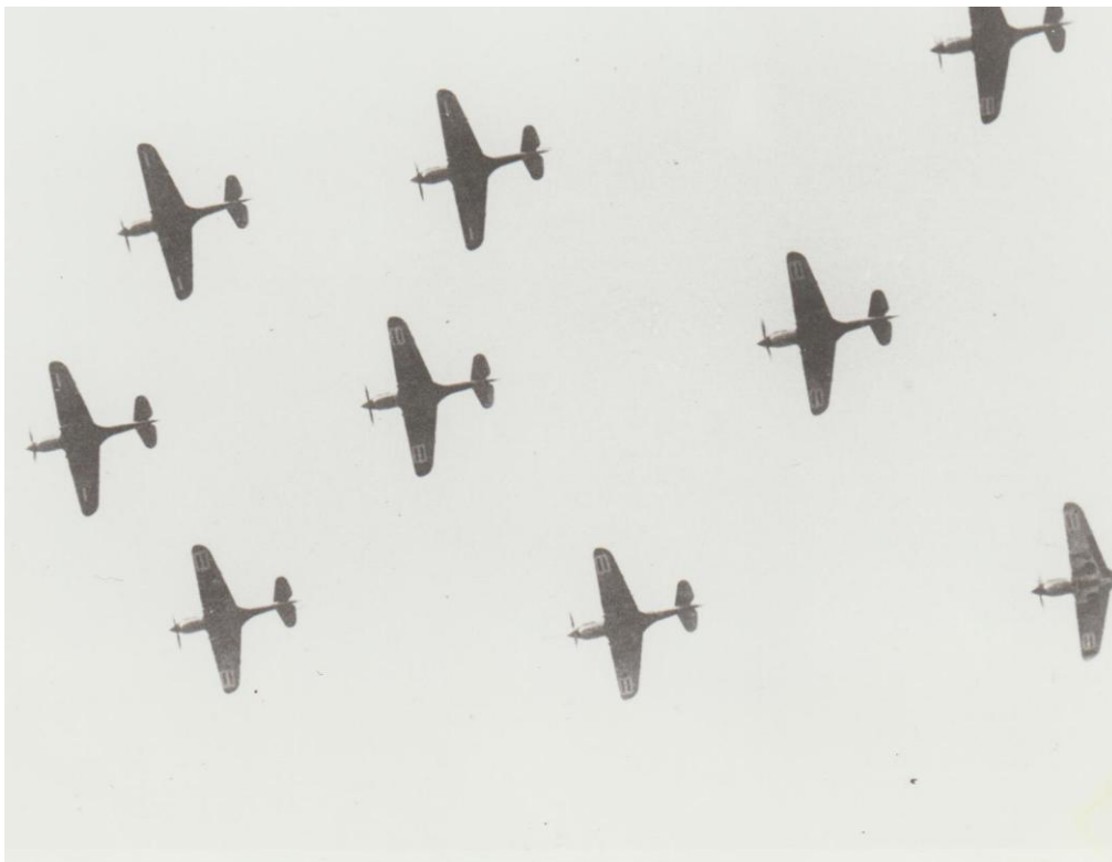
P-40s parading on 1 May 1946 at Tandjoeng Perak.