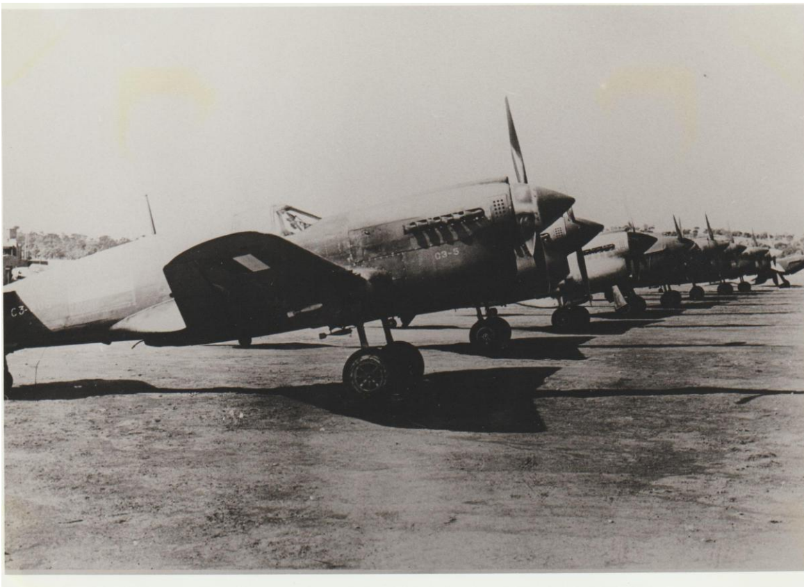
The P-40 C3-505 with practise bombs in a line-up also showing some of the first received P-51s at Canberra early June 1945.

over in early August. On 10 September the aircraft and main party of the Bomber Pool moved, leaving behind only a small rear echelon to clean up the hangar area and the aircraft dump. In April the ML had been informed that Canberra would have to be vacated and was given a number of options of which one was a move to Bundaberg. After some visits by ML officers Bundaberg was selected by the NEI War Office and in June 1945 the Australian Department of Air formally agreed with the move of the P.E.P. to this RAAF Station. Bundaberg had far better facilities than Canberra with nearby training areas also suitable for gunnery training. The RAAF Station was transferred to the ML with LKOl M. van Haselen who took over command of the P.E.P. from LKOl D.L. Asjes, MSc on 10 September, becoming CO of the RAAF Station at the same time. 105