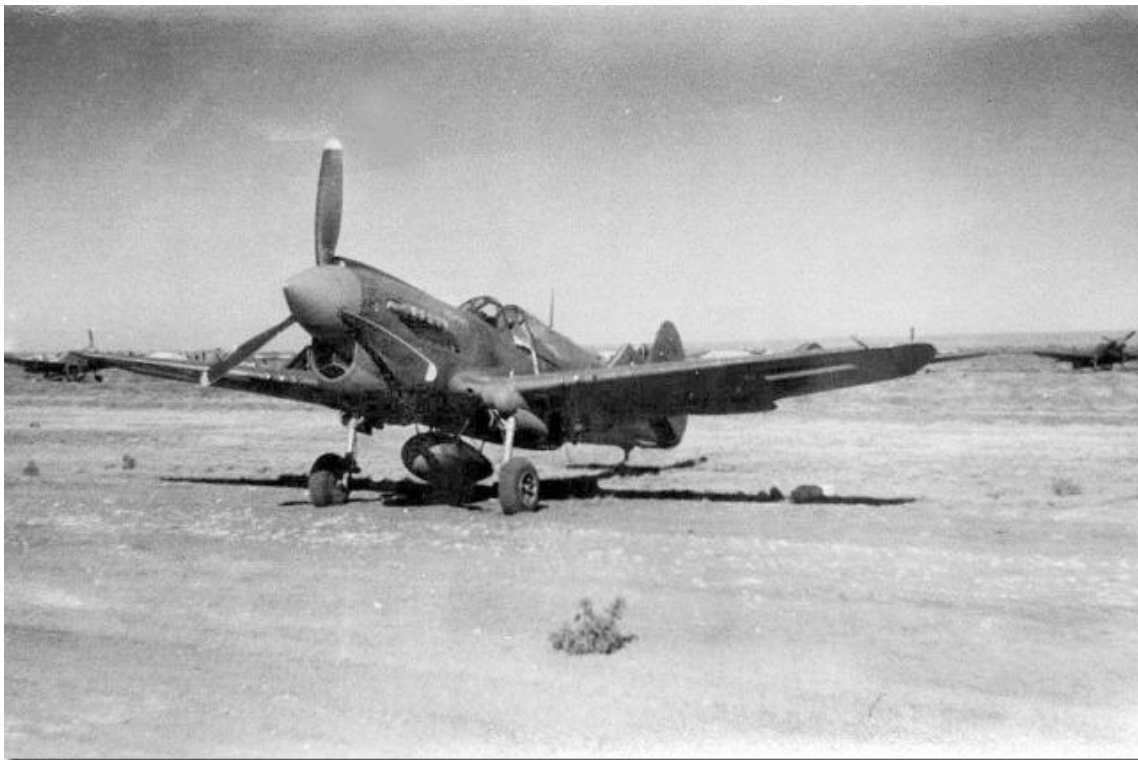
P-40s of 120 Squadron N.E.I. at Potshot in March 1944.

The two P.E.P. TB-25s were to leave with the first nine readied P-40s but one of the TB-25s had to return after take-off with a defect and had to be replaced. Therefore, only one TB-25 with seven P-40s were the first to leave on 9 March for Geraldton with Potshot, as it turned out, as a final destination. The P-40s were led by Maj Maurenbrecher. Four of the civilian operated transport aircraft left for Potshot on the same date. They were followed on the next day by the replacement TB-25 from the P.E.P. and the two remaining P-40s of the first echelon. The fifth civilian operated transport plane also left on the 10 th after a defect had been repaired. The P-40s were made rather limited operationally serviceable and left without harmonized gunsights and all the crystals needed for the radios. The wing guns were all armed, however. The remaining 15 P-40s had all been readied on 12 March and left the next day guided by three TB-25s (one from the P.E.P. and two from the T.S.M.), the T.S.M. C-47 leaving on the 13 th as well. 19