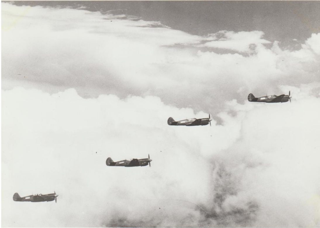
A section of the squadron on a training flight, June or July 1944.

mission was repeated the next day with again six P-40s now led by Elt Simons. This time all fighters reached Japero where some Anti-Aircraft (AA) fire was met. The attack on the encampment, a collection of huts and small buildings in the edge of the jungle bordering the shore, was not very successful. Some of the bombs fell into the sea and others in the jungle, while the effect of the bombs that did fall into the target area could not be observed. 49