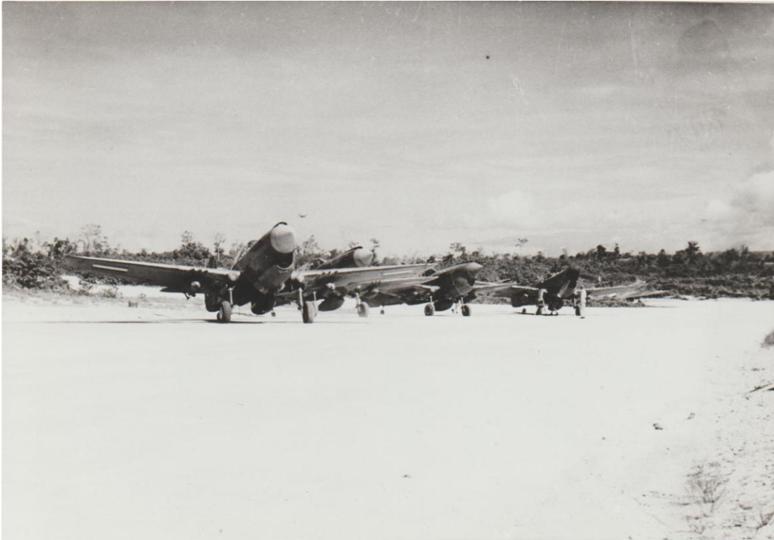
A section of four P-40s preparing for take-off at Mokmer armed with two 250 lbs bombs each in June 1945.

the other P-40s, later released by two of 15 Squadrons Beauforts. He was able to paddle out to the sea far enough to get out of firing range, though. Among the aircraft searching for Esser the next day was the L12A of 120 (N.E.I.) Squadron but he was found back by a Beaufort crew, transferred to a life boat dropped by an American Boeing SB-17 Air-Sea-Rescue aircraft and was covered by Beauforts again on the 21 st until picked up by a rescue launch. Three of the remaining P-40s returned to Mokmer on the 19 th but the fourth (pilot Elt Braun) had a landing gear collapse before take-off and had to stay at Middelburg for repairs. From 30 July 120 (N.E.I.) Squadron would again fly missions together with 15 Squadron RAAF (see below). 128