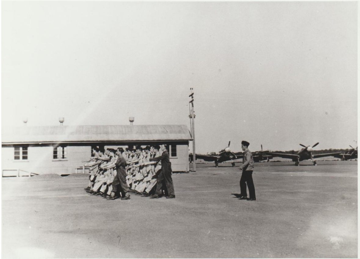
A class of the Technical School P.E.P. around October 1945 with P-40s and P-51s of the Fighter Pool in the back.

The ML had another more serious problem, though. As the war had ended the war volunteers who had started their training late July and during the first two weeks of August had to be demobilised after completing their training and given their contract could no longer be posted to a ML unit for a reasonable period of time. All war volunteers were therefore asked if they would be willing to change their war volunteer contract into a five-year contract for service with the ML/KNIL. Not surprising only approximately 70 eventually did so, although almost all students continued their training either with a RAAF school or (as the RAAF ground staff all of a sudden had to be replaced) “on the job” at a NEI squadron, some of the latter after a short course at the P.E.P. The majority of the approximately 152 war volunteers who started training with 1 ES did not sign a new contract. Most were eliminated from their course shortly after VJ Day and reassigned on 1 September 1945. Approximately 30 to 35 students in a newly formed class, to a large part students who had first followed the jungle warfare training from around 1 August 1945, continued the training at 1 ES although a number of them