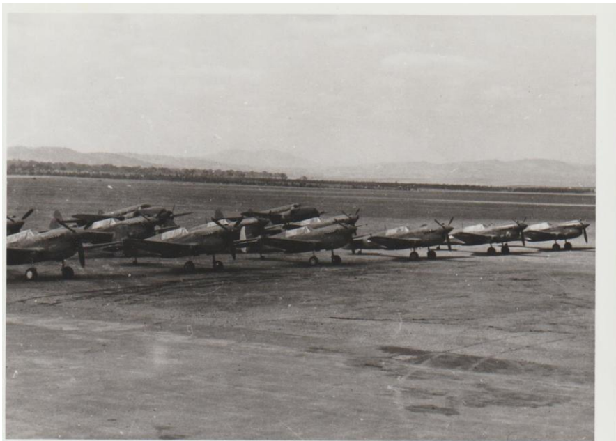
P-40s of 120 Squadron N.E.I. at Canberra in January 1944.