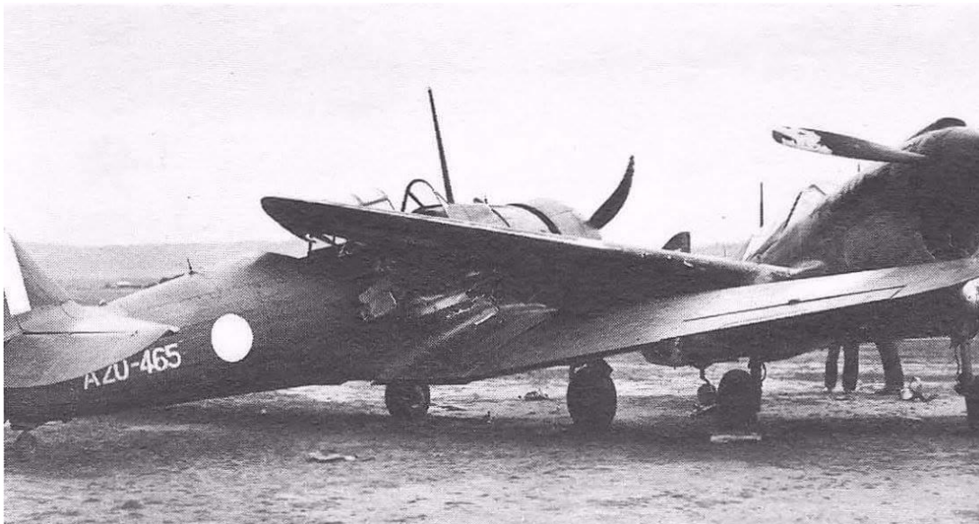
The C3-519 and Wirraway A20-465 after their taxi accident on 11 June 1945 at Canberra. Both aircraft were severely damaged.

C3-519 43-22771 010144 received 120 Sq Canberra; 120 Sq Canberra 0144-0544; 120 Sq Merauke 0544-0245; 0245 transferred to P.E.P. Canberra ex 120 Sq; P.E.P. 0245-0645; 110645 major damage in taxi accident with a RAAF CAC Wirraway at Canberra; written off 0745.